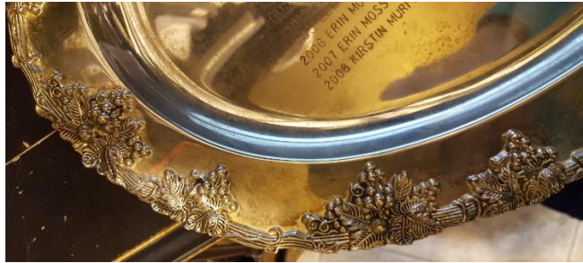
The Jerry Morrison Trophy