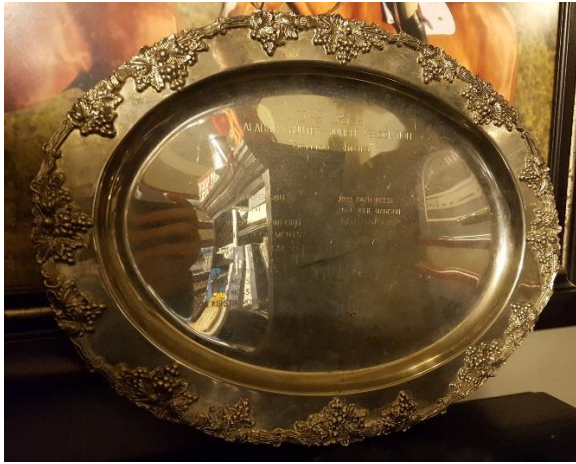
AHJA Service Award