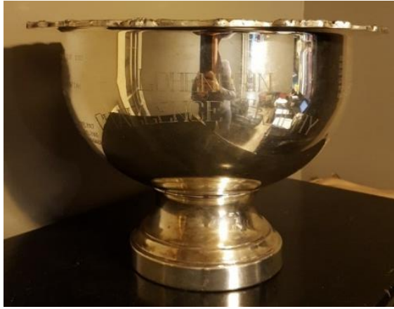
April Abbot High Point Short Stirrup Equitation Over Fences Trophy