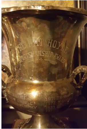
The Little Equestrian That Could